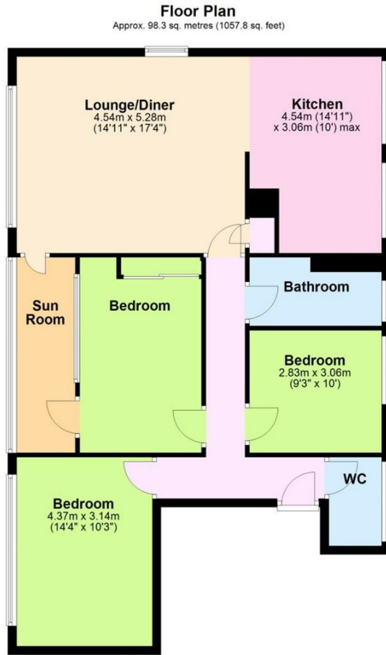
Total area: approx. 98.3 sq. metres (1057.8 sq. feet)